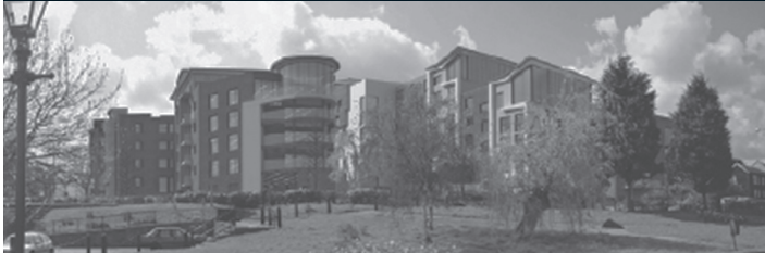
Edinburgh House's proposal for Gravesend's Heritage Quarter.

You may by now have read in the local press that developers Edinburgh House have withdrawn their appeal against the Council's refusal of the planning application for the Heritage Quarter Scheme.